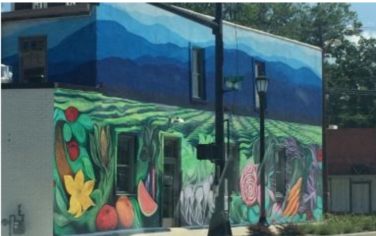
I could see a mural like this or something similar in one of your communities for the Farmer's Market.