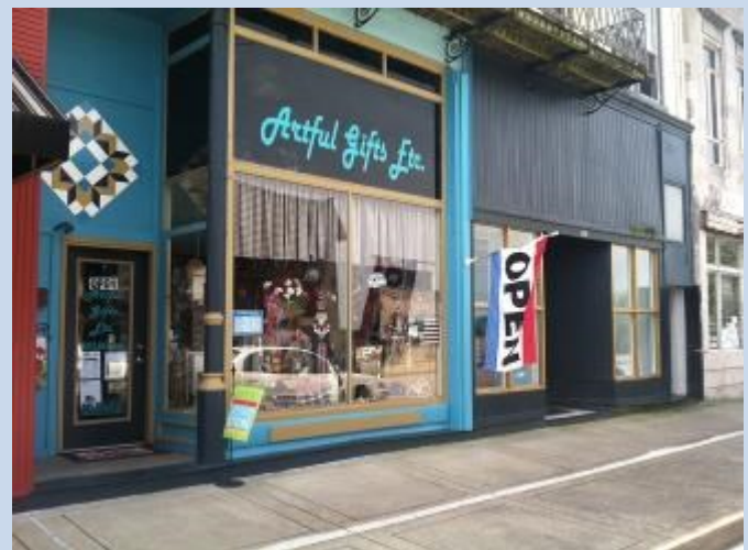
Business expansion on Carrollton Main Street!

Go online: www.duckrace.com/perryville or Stop in at the Perryville Branch of Farmers Bank or visit Main Street Perryville to purchase your Turtles. $5 a turtle or $25 for a nest of 6 turtles. Prizes are $1,000 1st, $600 2nd and $400 3rd place. You do not have to be present to win. Get your turtles now!