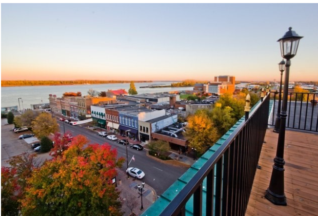
Congratulations to Paducah! They were named one of the Most Beautiful Main Streets in the country by Architectural Digest!